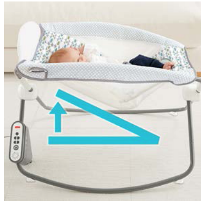
Above: Figure 2