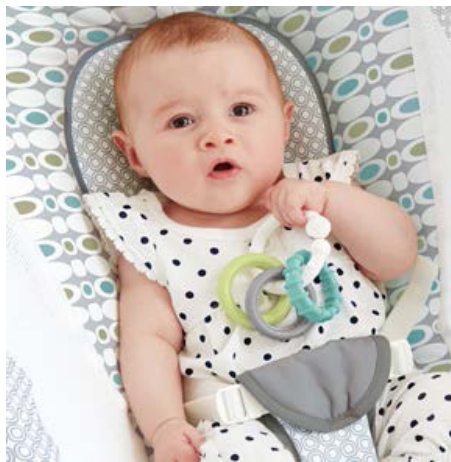
Above: Figure 3