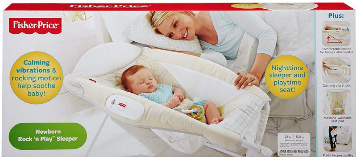
Above: Figure 7