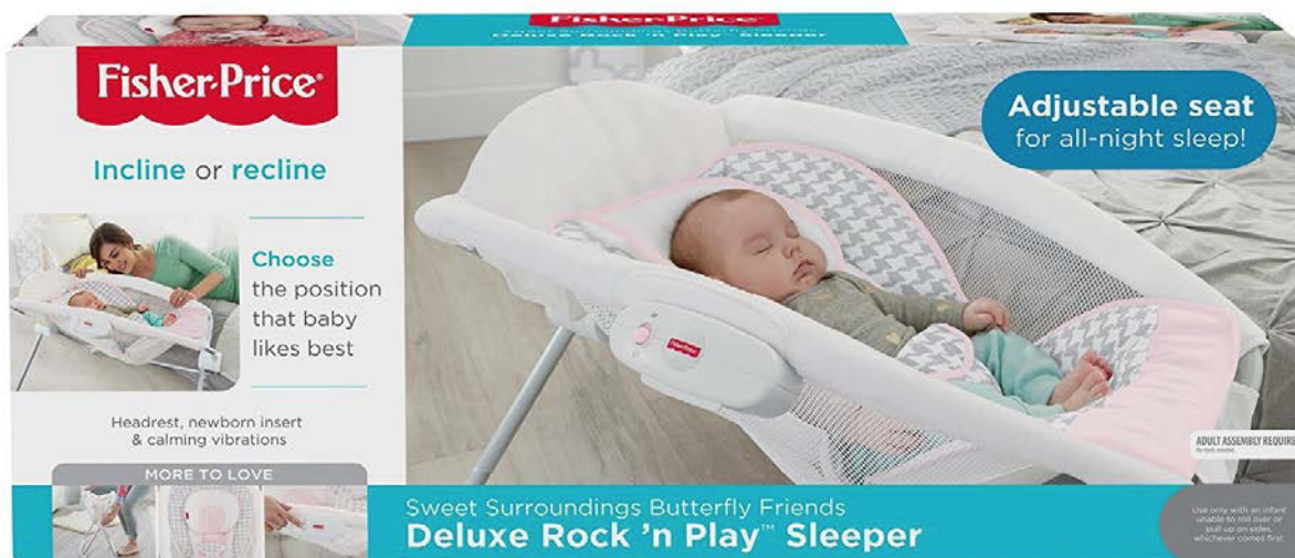
Above: Figure 8

97. The marketing statements on the packaging conflict with the AAP’s guidelines and recommendations, and those of other infant sleep experts.