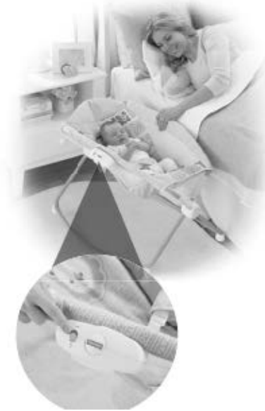
Above: Figure 11

130. This image is misleading because it implies that mothers can sleep when their babies are in the sleepers, while, at the same time, Defendants warn that babies should be supervised when in a Rock 'n Play Sleeper. Mothers cannot supervise their children when they are themselves sleeping.