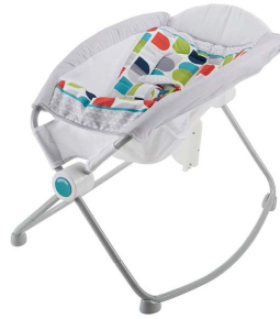
Above: Figure 1

soft padded material (Figures 4 and 5), upon which the baby is placed. Different views of the product are shown below: