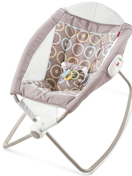
Above: Figure 4